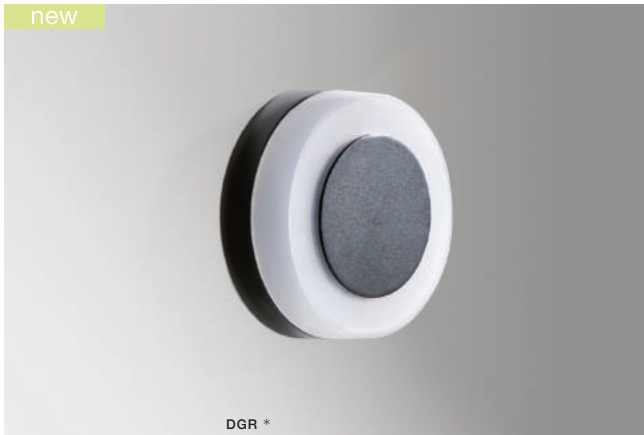
ENOK ROUND WALL 3000K