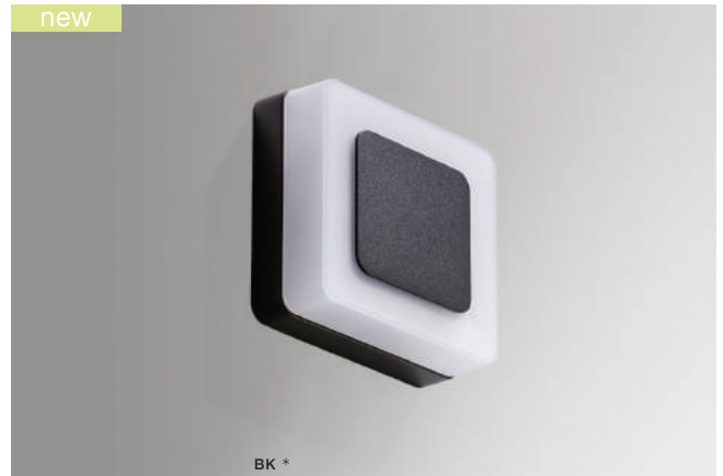
ENOK SQUARE WALL 3000K / 4000K